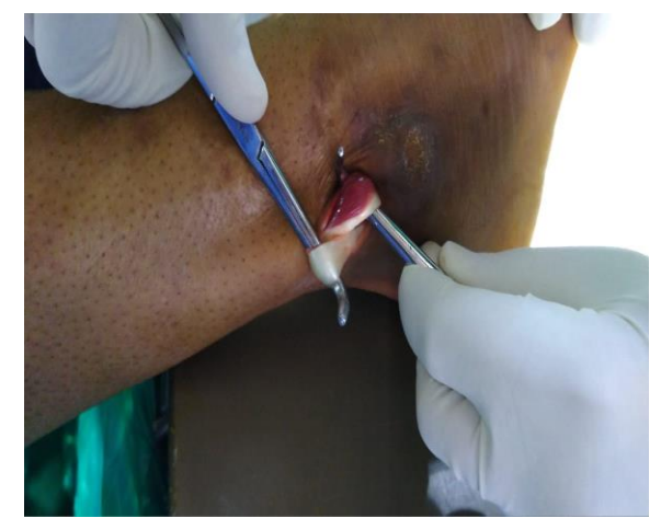
Fig. 1: Showing peroneus longus (white shiny tendonious structure) and peroneus brevis (with muscle tissue) tendon

longus tendon was identified and sutured distally with peroneus brevis tendon. Tendon was then harvested using closed tendon stripper. Graft was prepared and folded into double/quadruple strands for single bundle ACL reconstruction (Fig 2). Thereafter appropriate femur and tibial tunnels (Fig. 3) were created and graft was secured at anatomical sites of femur and tibia using endobutton/titanium screw/PEEK (Polyethylene ether ketone) screw (Fig. 4). After reconstruction, stability of ACL was checked by Lachman's test, which showed no laxity.