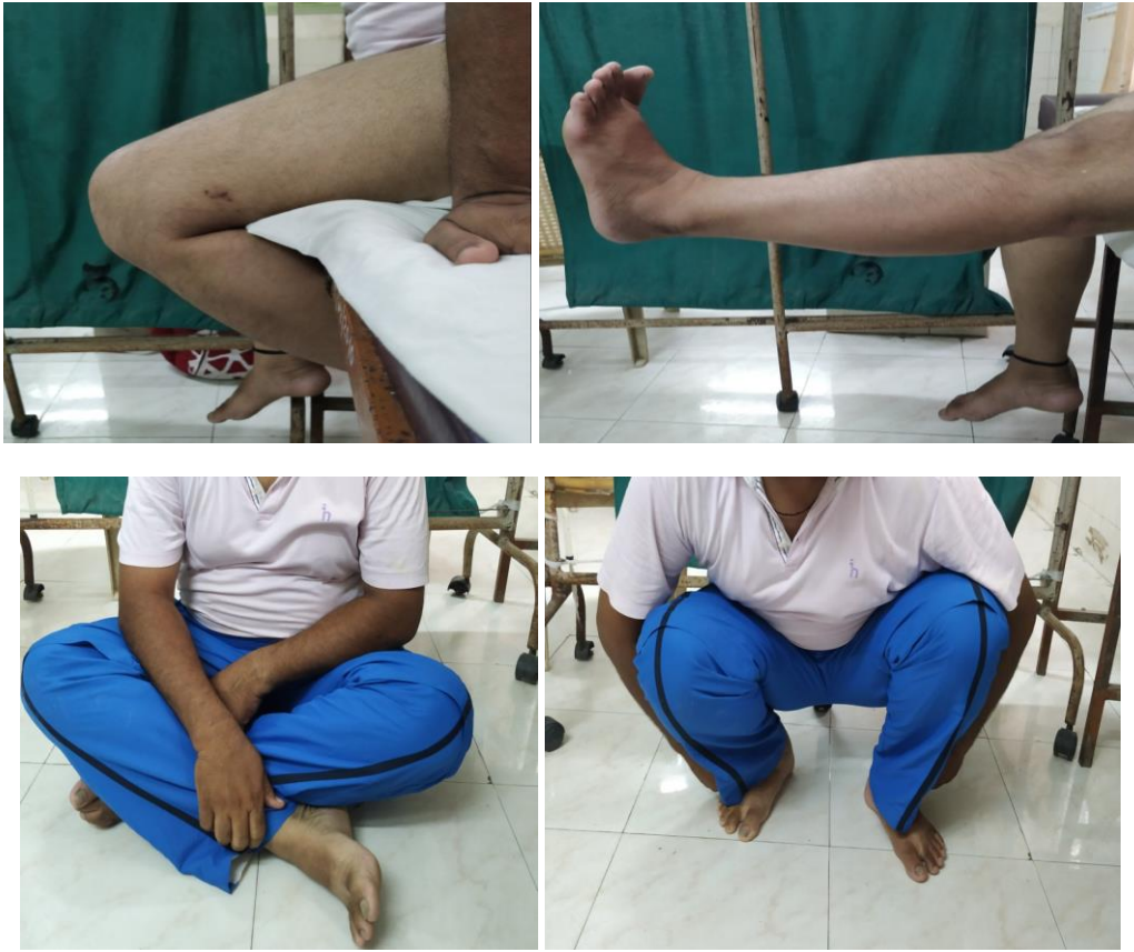
Fig. 6: Clinical picture showing functions/range of motion of knee

hypoaesthesia due to injury to infrapatellar branch of saphenous nerve can be prevented. A previous study by Angthong et al mentioned possible donor site morbidity using peroneus longus autograft, such as reduced peak torque eversion and inversion, decreased ankle functions and concerns about ankle stability.<sup>3</sup> In our study mean for AOFAS is 94.5 +/- 1.5 and FADI is 94.2 +/- 1.1, which shows minimal donor site morbidity and no significant deterioration in ankle function. Peroneus longus autograft produces a excellent functional score (Lysholm scoring system) in 80% of our patients and remaining 20% patients had good functional score (Fig. 6).