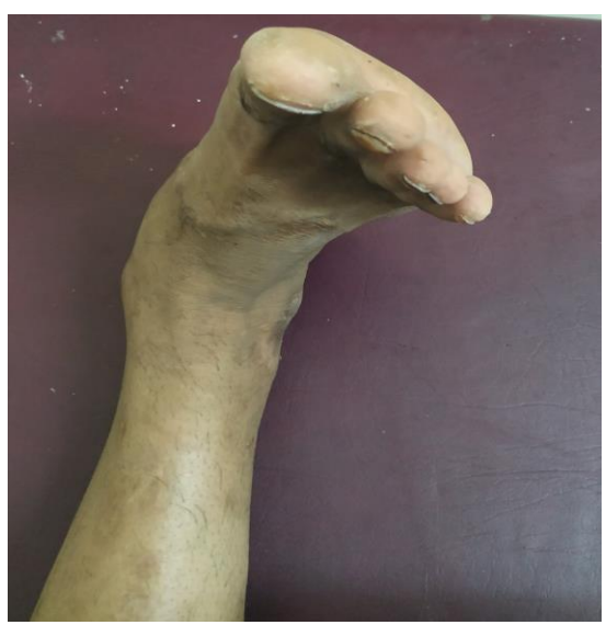
Fig. 5: Showing eversion of ankle post operatively (after peroneus longus harvest)

Post operatively, from first day patient is taught static quadriceps, ankle pump and knee range of motion exercises and partial weight bearing. Each patient was encouraged to stretch the affected ankle gently and actively from first day postoperatively. At 3<sup>rd</sup> week patients were allowed full weight bearing.