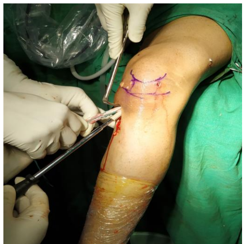
Fig. 4: Graft fixation using PEEK screw