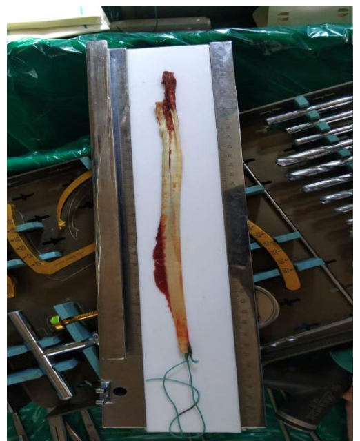
Fig. 2: Peroneus longus tendon (27 cms) graft preparation