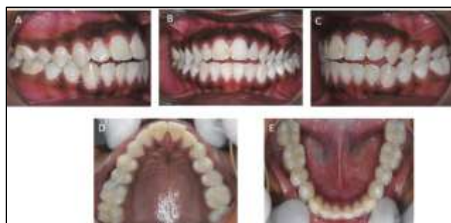
Fig. 2: Pre – treatment intra-oral photographs

The maxillary dental midline was coincident with the facial midline. The lower dental midline was shifted to the left by 2mm with respect to the maxillary dental midline. Intra-oral examination revealed a tapered maxillary arch with unilateral posterior crossbite on left side and ovoid mandibular arch with imbrication in lower anteriors. The canine relationship was end-on relationship on the left side and class I on the right side. Molar relationship on left couldn't be established because of the cross-bite. The patient had an anterior open bite (3 mm) and an overjet of 2mm (Fig. 2. A, B, C, D, E).