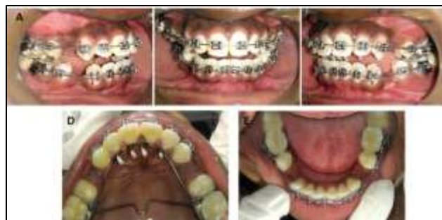
Fig. 5: Post expansion with strap up

At the end of four months, once the arch was over-expanded such that the palatal cusps of the maxillary 1 st molars were in contact with the buccal cusps of the mandibular 1 st molars, maxillary expansion along with mandibular bite plane was discontinued, and the appliance was left in place for 1 month as part of the retention protocol and fixed appliance treatment was initiated after extraction of all 1 st pre-molars using 0.022 X 0.028-inch MBT prescription (Fig 5. A, B, C, E).