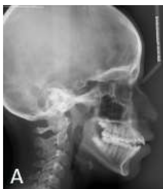
Fig. 3: A: Pre-treatment Orthopantomogram revealed no abnormalities.

dimensions were within the normative values. (Table 2) (Fig. 3. B).