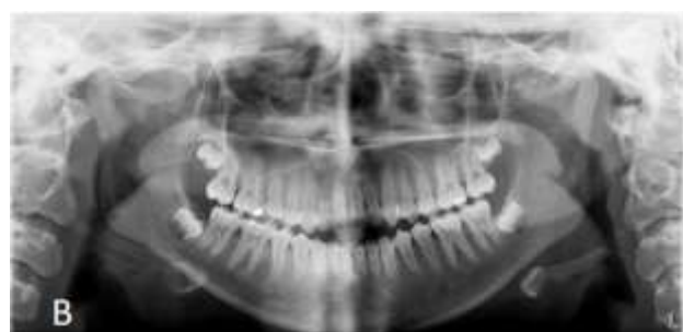
Fig 3 B: Pre – treatment OPG and Lateral Cephalogram

On lateral cephalometric evaluation, the patient had orthognathic maxilla and orthognathic mandible on a high mandibular plane angle, increased lower facial height with proclined upper and lower incisors. There were no signs of airway obstruction in the lateral cephalogram and airway