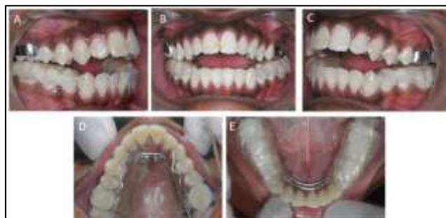
Fig. 4: Customized quad helix with acrylic covering on I quadrant to allow unilateral expansion on the left.

The treatment commenced with banding of upper 1st molars and quad-helix fabricated of 0.036-inch stainless steel wire was soldered to the bands for crossbite correction. The lingual arms were extended bilaterally up to the canines and helices were placed as anteriorly possible. To reinforce anchorage acrylic was added to the quad helix on the non-cross bite to harness the palatal soft and hard structures. Anticipating some amount of palatal tissue irritation, a soft liner was added over the palatal surfaces. Simultaneously, lower posterior bite was inserted to open the bite to facilitate crossbite correction without resistance. The quad helix was preactivated unilaterally, such that the molar bands on the cross-bite side were half-way past the buccal surface of the upper left 1 st molar (Fig 4. A, B, C, D, E).