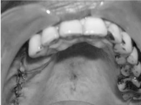
Fig. 6: Post-operative photograph