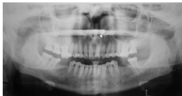
Fig. 4: Panoramic Radiograph showed diffuse hazy uniform radiopacity in the right maxillary sinus and the floor of the sinus was unable to appreciate compared to the left side