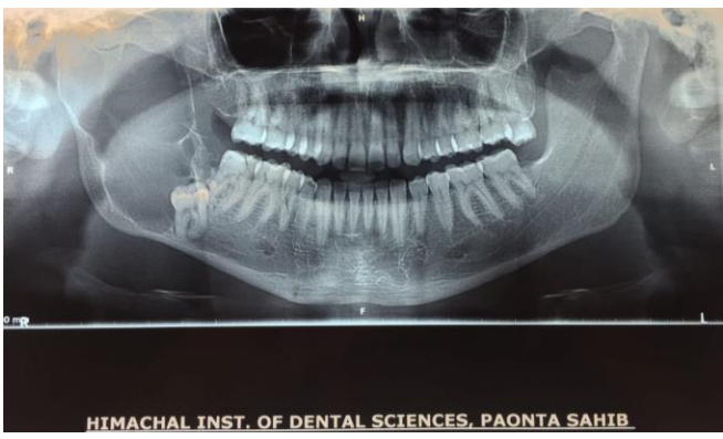
Fig. 3: OPG of patient showing well defined unilocular radiolucency on right ramus and body region extending till the mandibular canine region