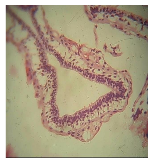
Fig .7: Cystic fibrous wall is seen with follicular ameloblastoma islands. (40X)