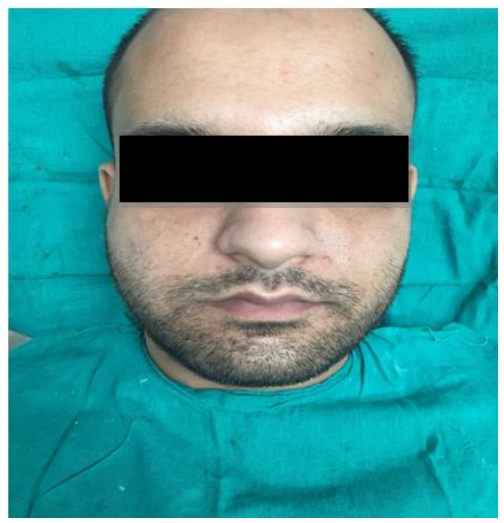
Fig. 1: Extraoral pre operative photograph

remaining 11 out of total 15 mural type. The cystic lining seen is consistently showed, at least in part, a typical ameloblastomatous pattern that is often accompanied by epithelial areas of various histological appearance. On the basis of above mentioned conclusions the final diagnosis of unicystic ameloblastoma type intra luminal type and intra mural type was made.