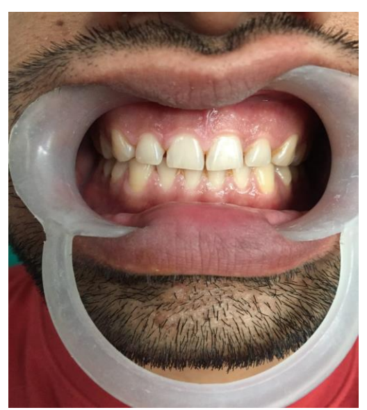
Fig. 2: Intra oral photograph