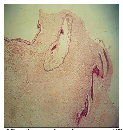
Fig. 4: Microphotograph under scanner (4X) view showing cystic lining with underlying fibrous connective tissue wall