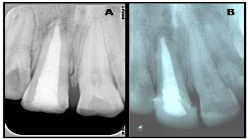
Fig. 4: (A) Immediate postoperative, (B) 12-month recall