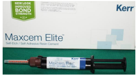
Fig. 14: Maxcem Elite self-etch, self-adhesive resin cement (kerr)