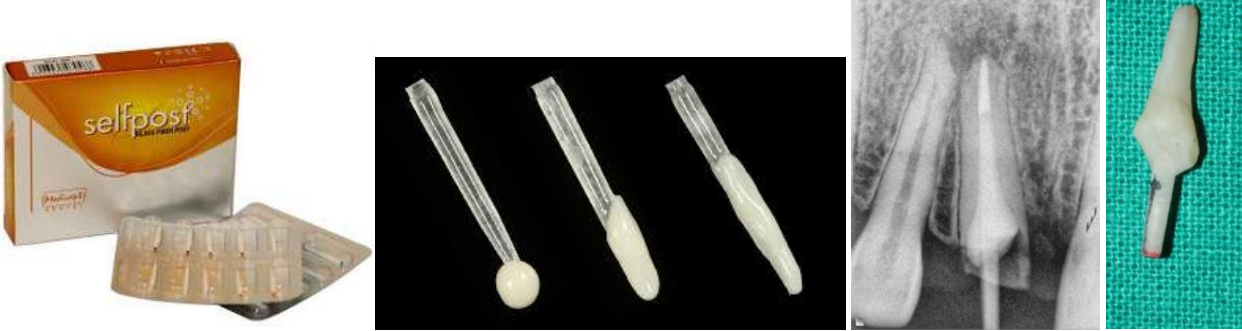
Fig. 8: Radiographic and clinical appearance of anatomic post