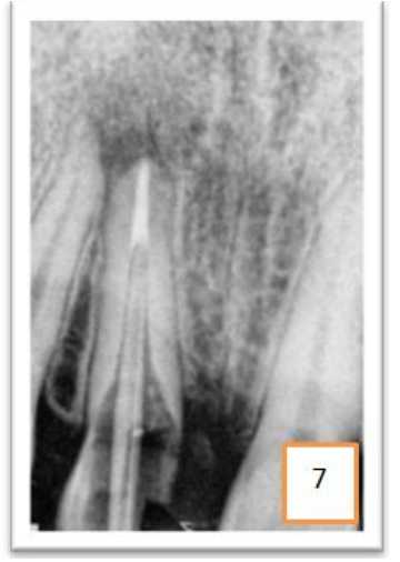
Fig. 3-7: Working length # 21mm, Master cone, Obturation, Post space preparation, Post fit