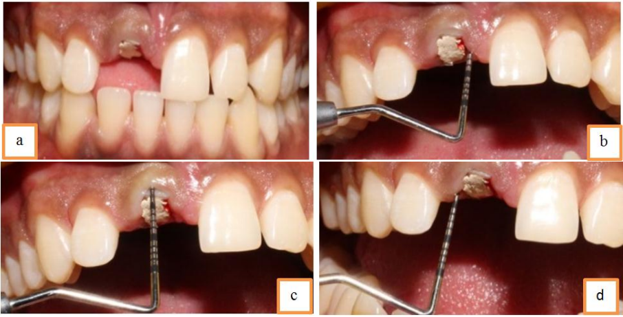
Fig. 9: (a-d showing pre-operative required length for CLP)