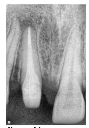
Fig. 12: Final radiographic appearance glass fiber post and core