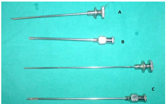
Fig. 2: Parker-Pearson needle used for biopsy

needle biopsy were knees -33 cases (66%), wrist -7 cases (14%), hips -5 cases (10%), elbow -1 case (2%), ankle 1 case (2%), foot - cases (4%) and S.I. Joints -1 case (2%).