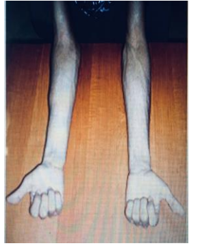
Fig. 4: Range of Movements after operative intervention