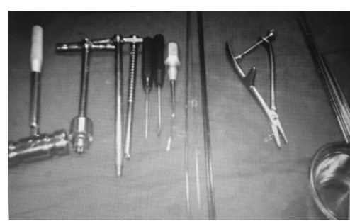
Fig. 2: Instruments used for the technique

after it reach the proximal radius a gentle reduction with the tip of the TEN was done under fluoroscopic control. The confirmation was done under AP and Lateral views of IITV. The appropriate length was estimated and nail was cut flush to the styloid process protecting the skin and surrounding soft tissue. According to the width of the intramedullary canal, one TEN with measured thicknesses was used for closed intramedullary pinning in all patients. All the surgeries were done on the 3<sup>rd</sup> or 4<sup>th</sup> admitted day(average interval 1-7 days). Patients were immobilized post operatively with a Above elbow slab for 2 days for pain relief and subsidence of swelling. Regular dressings were performed on 2<sup>nd</sup> and 4<sup>th</sup> postoperative day. The check x-ray was performed at 1 week. Mobilization was started after the check x-rays of 4 weeks. Nail was removed after the union was achieved.