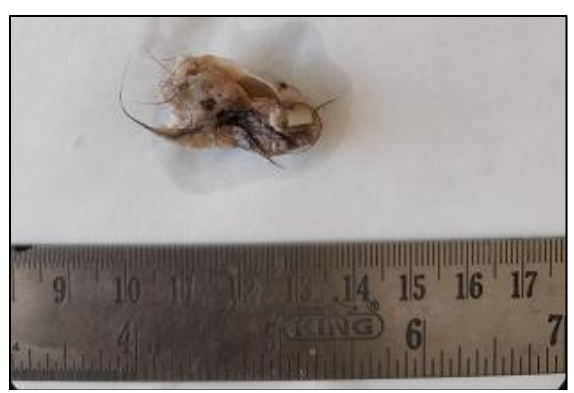
Fig. 2: Left ovary was grossly cystic and on cut section lumen is filled with sebaceous material and tufts of hair. A tooth was identified attached to the left ovarian outer surface