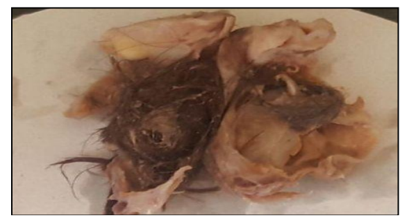
Fig. 1: Right ovary was grossly cystic and on cut section the lumen was filled with sebaceous material and tufts of hair

within normal range (29.2U/mL). Laparoscopic bilateral oophorectomy was done along with bilateral tubal ligation. Both the ovaries were sent in separately labelled containers for histopathological evaluation. Right ovary measured 2.5x2.3x2 cm. Left ovary was received in 2 pieces measuring 4x3x2.6cm and 3x2.6x1cm. Grossly, both the ovaries were cystic and on cut section lumens were filled with sebaceous material and tufts of hair. A tooth was identified attached to the left ovarian outer surface. [Fig 1 & 2] Microscopic examination of both the ovaries showed ovarian cyst walls lined by stratified squamous epithelium, pseudostratified columnar epithelium, adnexal structures like hair follicles, pilo-sebaceous units, sheets of foamy macrophages along with foci of mature cartilage and mature adipocytes. The cyst cavity contained keratinous material. The wall showed mononuclear inflammatory infiltrate, foreign body giant cell reaction and large areas of haemorrhage. Thus, on histopathological examination the diagnosis of bilateral mature cystic teratoma of the ovaries was rendered. [Fig. 3 & 4]