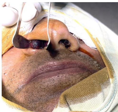
Figure 1: Clinical photograph showing anterior rhinoscopy picture of the lesion in the right nasal vestibule.

habit of forceful nose blowing almost daily. He had a history of hypertension for the last 5 years and was taking medications for the same regularly. There was no other medical condition. Anterior rhinoscopy was done and a small, solitary, 1x1 cm in size, smooth, dark red coloured, soft tissue mass with overlying ulceration and crusting at some areas was seen in the right nasal vestibule area (Figure 1).