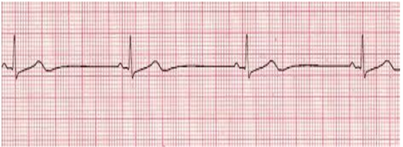
Figure 1: Showssinus bradycardia