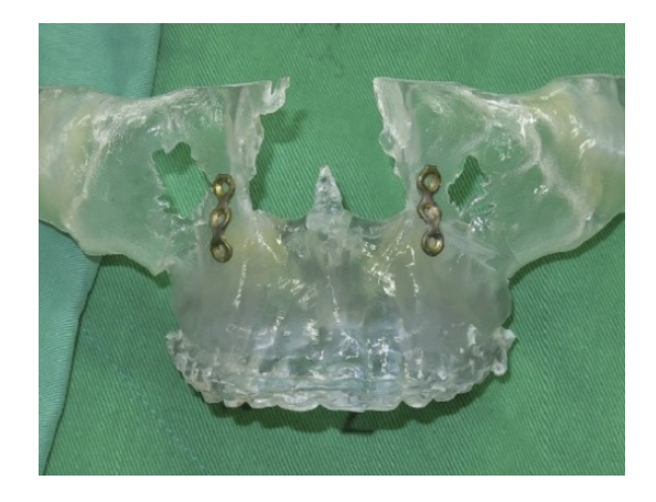
Figure 4: 3-D surgical model with precisely adapted miniplate