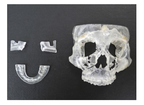
Figure 3: 3-D printed surgical guide and splint