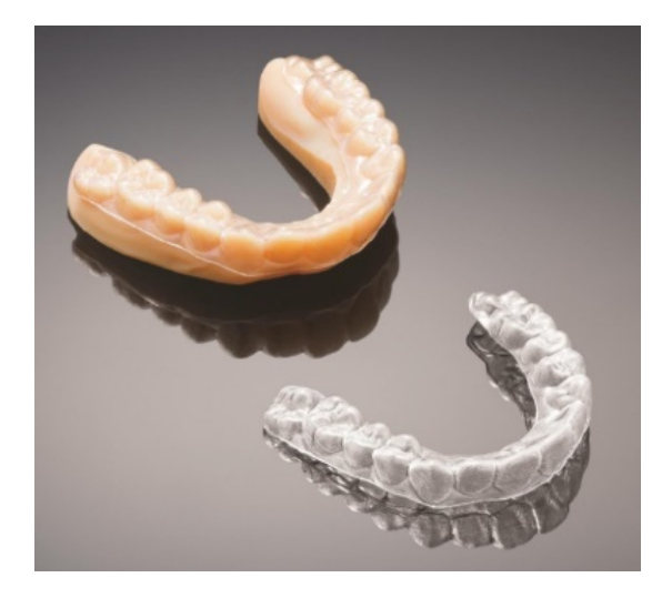
Figure 1: 3-D printed aligners

Fabrication of 3-D models from computer-generated images has greatly improved the surgical outcome in many orthognathic surgery cases through precise pre-operative assessment, surgical planning, intra-operative orientation, and pre-bending of mini plates for fixation (Figure 4). Many of the drawbacks of conventional surgery like inaccuracies in segment positioning and abnormal condylar positioning or sag can be avoided by this novel method of model fabrication.<sup>38</sup> Common technologies for the fabrication of 3-D printing models are Selective Laser Sintering (SLS), Three Dimensional Printing(3DPTM), and PolyJetTM.