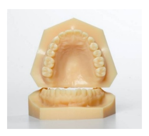
Figure 2: 3-D printed study models