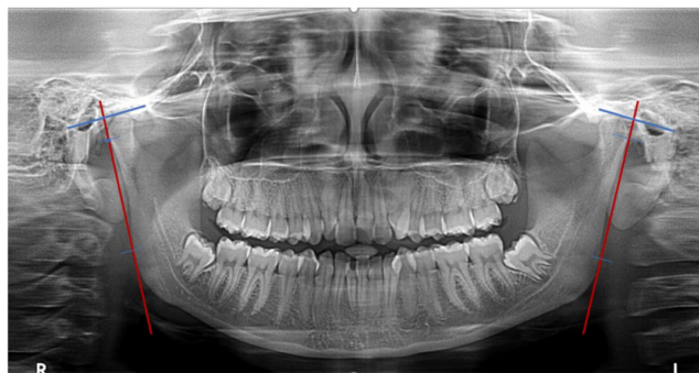
Figure 1: Tracing on an OPG

To obtain Orthopantomogram, patient were positioned in the dental panoramic machine in such a way that the vertical line produced by the machine was aligned with subject's facial midline and horizontal line (Frankfort plane) was parallel to the floor. The patient were asked to bite the biting fork with anterior teeth and the dorsum of the tongue touches against the palate with relaxed lips. The chin of the subject was placed on the chin rest. Lateral head stabilizer was used to support patient head. Patient was explained that the tube moves around the head while taking OPG. All images were made by Planmeca proline XC panoramic machine in the Department of oral medicine and Radiology.