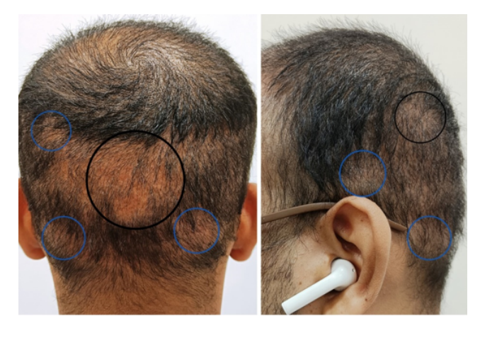
Figure 1: Acute donor effluvium involving the donor (black circle) and peri-donor area (blue circle). (Attached separately)

SALT: Severity of Alopecia Tool, N: Number, %: Percentage. *p value of <0.05 is taken as significant.