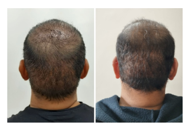
Figure 5: Image of the patient showing appreciable recovery within 3 monthspost transplant. (attached separately)