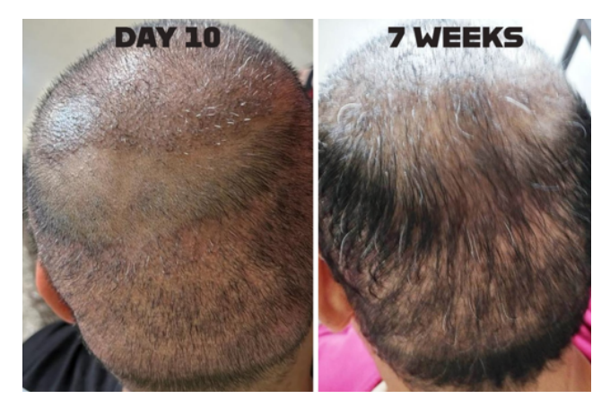
Figure 4: Image of the patient showing acute donor effluvium on 10^{th} day and after 7 weeks of transplant. (attached separately)