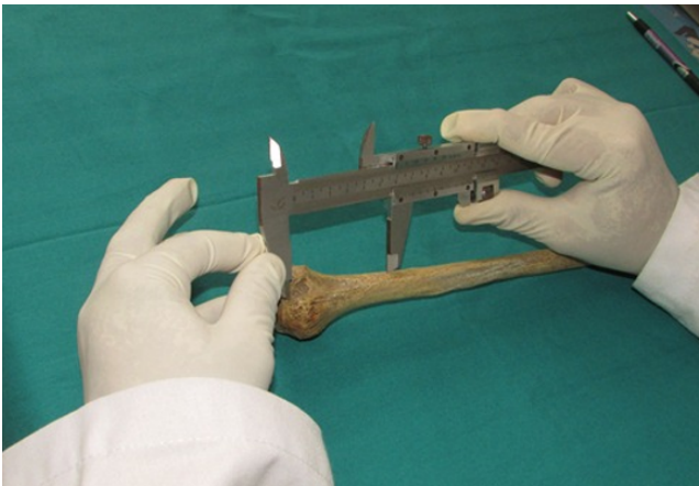
Figure 2: Method of measurement of the length of bicipital groove of humerus

Variation is the rule in God’s creation. The human body is not exception to this law. Some variations which may be developmental on acquired can give rise to abnormal functioning of the of the human physiology. Morphometric variations are not uncommon in intertubercular sulci of humerii. Functioning of the tendon of long head of biceps brachii is intimately dependent on intertubercular sulcus morphometry. 15,16