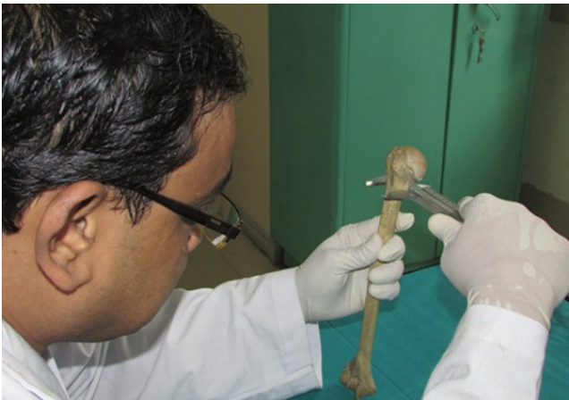
Figure 3: Method of measurement of the Transverse diameter of surgical neck of humerus

Humeral dimensions are correlated with different dimension of the intertubercular sulcus. Measurement of length, width and breadth gives the idea about anthropometry of the sulcus. 17