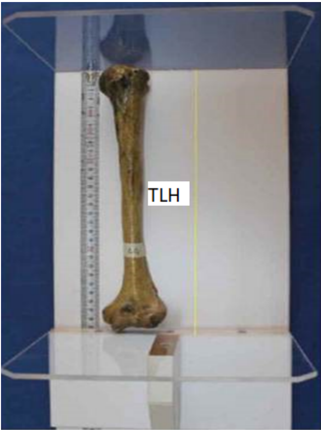
Figure 1: Measurement of total length of humerus by osteometric board

*(indicates that the correlations are significant at 0.05 level of significance)