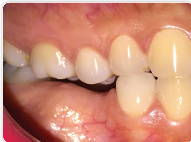
Figure 1 Pretreatment intraoral right buccal view

Two microimplants 1.3 mm × 8 mm (S.K. Surgicals, Pune) were used for anchorage, one was inserted buccally in the interdental area between upper right 2nd premolar and 1st molar at the mucogingival junction with an angle of 45° to the