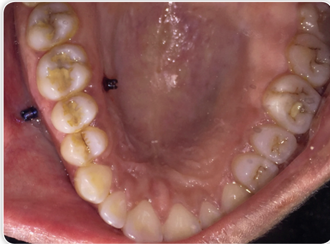
Figure 2 Orthodontic microimplants inserted buccally and palatally between maxillary 2nd premolar and 1st molar