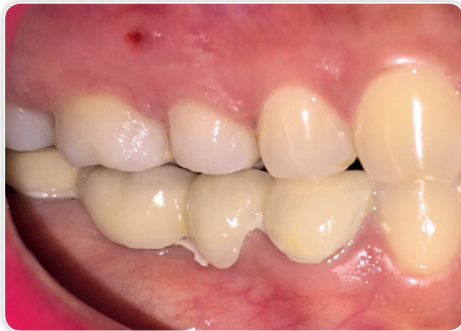
Figure 6 Post-treatment Intra-oral right buccal view