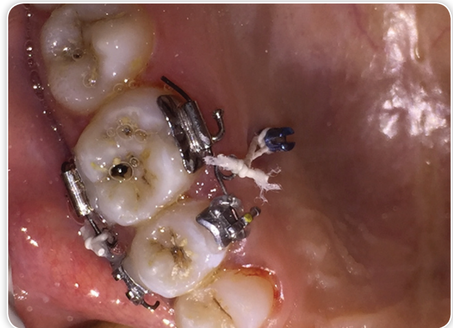
Figure 4 Palatal sectional fixed appliance and elastic thread tied from head of buccal microimplant upto hook on archwire