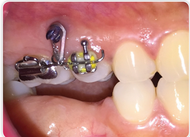
Figure 5 Intraoral right buccal view showing leveled maxillary occlusal plane

long axis of the teeth (Fig. 2). The second microimplant was inserted on the palatal slope in the same region around 7 to 8 mm from the alveolar crest. Both microimplants were inserted under topical anesthesia using self-drilling mechanism.