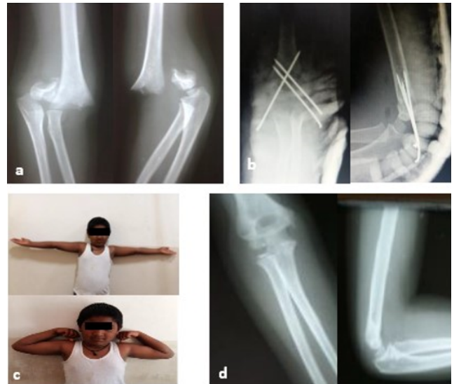
Fig. 2: Anteroposterior and Lateral view of Supracondylar fracture Humerus left side (a) with percutaneous K-wire fixation (b), elbow range of movements (c), and radiological union of the fracture (d).

views of image intensifier. The lateral pin was inserted through the center of the lateral epicondyle. The K-wires used were of 1.2 mm to 2.0 mm diameter. The pins were inserted at an angle of 30 degrees obliquity to the long axis of the humerus in coronal plane. After pin insertion, stability of the fixation was confirmed under image intensifier with flexion and extension of the elbow joint and also valgus and varus forces. The pins were cut after bending and the bent part was kept outside the skin for easy removal at 6 weeks. The involved limb was supported by well-padded posterior POP slab with elbow in neutral position before shifting the child to the ward. The operated limb was kept elevated and active finger mobilisation was encouraged. Postoperatively, intravenous antibiotics were given for three days along with analgesics and other supportive treatment. Radiograph of the operated elbow was taken on the next day to see the fracture fragment alignment. Patients were advised to come for regular follow up and were discharged on third day. Parents of children were explained about the care of the POP slab, the importance of active finger movements, and