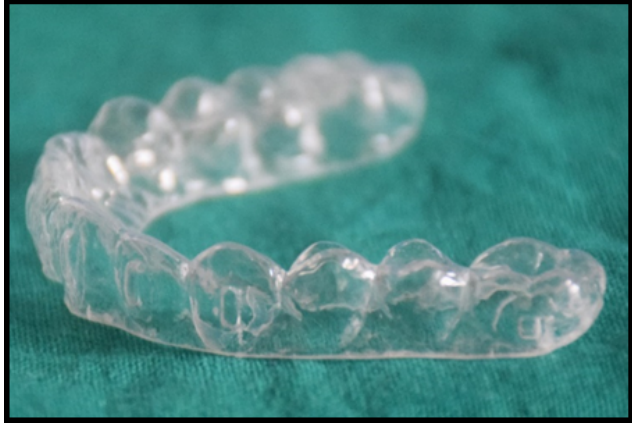
Fig. 1: Sample photo of clear aligner

With such two-step retraction common side effects like steeping of curve of spee are avoided and better control over bodily movements are achieved.