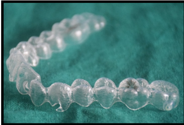
Fig. 2: Sample photo of smart track invisalign aligner