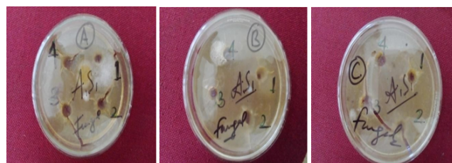
Fig. 3: Petri plates showing zone of inhibition.