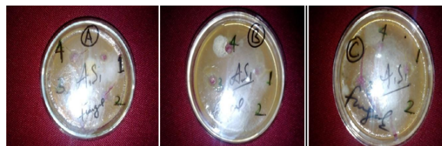
Fig. 2: Petri plates showing zone of inhibition

Present research reported the presence of phenolic compounds, glycosides, tannins, carbohydrates, proteins, amino acids, tannins, reducing suger, non-reducing suger and inorganic compounds such as calcium, magnesium, iron, carbonate & sulphates by preliminary phytochemical analysis. Plants containing phenolic compounds possess good antioxidant properties. Therefore Brassica rapa may also possess activity against a panel of fungus responsible for the most common fungal diseases like many other antifungal drugs.