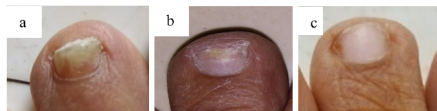
Fig. 3: a: Left Middle toenail, before treatment; b: Left Middle toe nail, after two months of treatment; c: Left middle toe nail, after three months of treatment