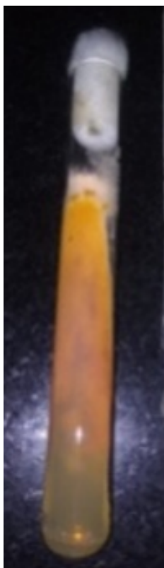
Fig. 1: Colony morphology of Trichophyton soudanense on Sabouraud's Dextrose Agar

reflexive branching and no macroconidia [Fig 2a and 2b]. On Lowenstein-Jensen medium, the isolates produced dark brown pigment. Urease test and hair perforation test were negative. 1 He was started with Itraconazole 200mg twice daily for first seven days of every month for three months, since August 2018. The fresh healthy nail started growing in his toe [Fig 3b and 3c].