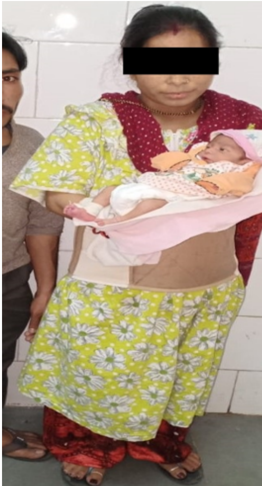
Fig. 3: The second patient with her achondroplastic husband