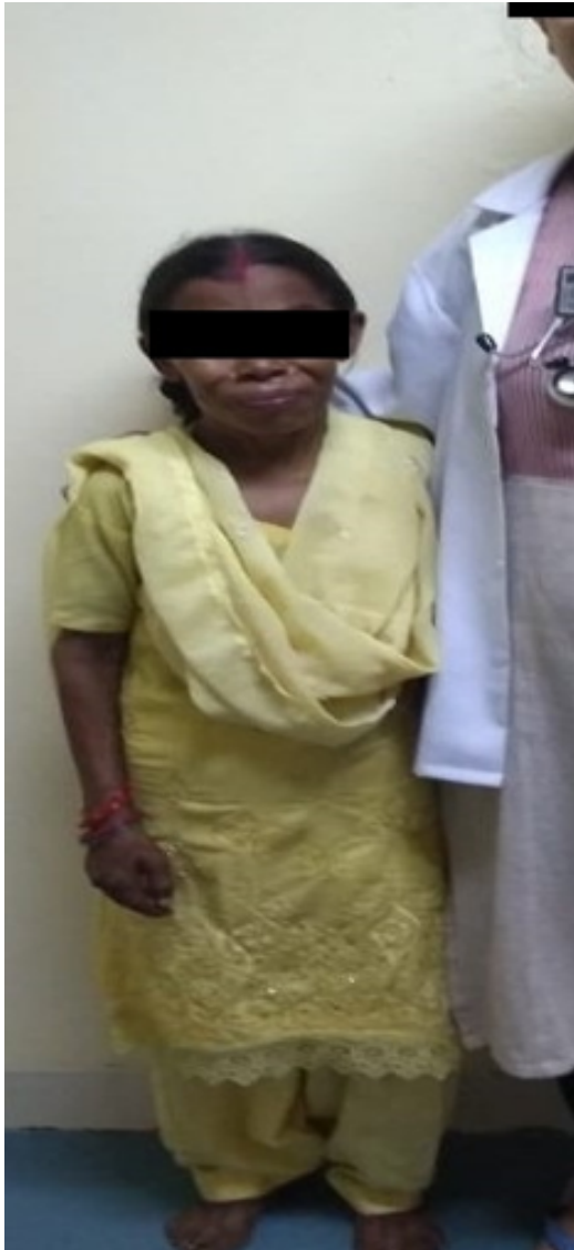
Fig. 1: The short stature of achondroplastic female patient as compared to a female of normal stature

II. Her systemic examination was within normal limits except for mild thoracic kyphosis and scoliosis. (Figure 1 and Figure 2) Her preoperative baseline investigations were within normal limits.