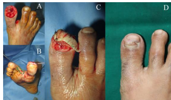
Fig. 1: A. Pre-operative photograph showing, great toe tip defect with exposed bone and partial nail bed loss. B. Flap markings showing the reverse direction and extension into the web space. C. Flap inset without tension reaching to the distal medial toe tip. D. Two months post op photograph showing well settled flap.

under ankle block and under tourniquet control. The division of the flap was done in the third postoperative week. We could achieve good aesthetically impressive result without functional morbidity (Fig. 1 D). Diagrammatic representation of the flap planning (Fig. 2).