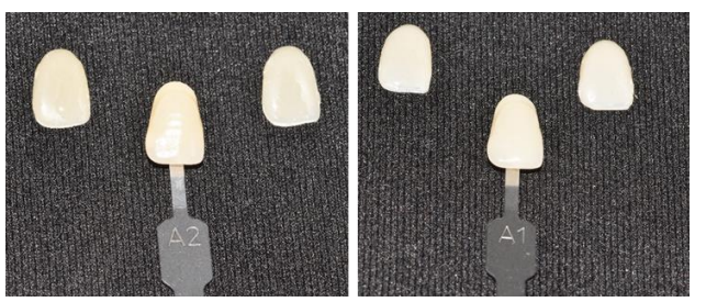
Fig. 1: Representation of customized shade tab and Vita classic shade tab.

A small portion of enamel was placed in the first mould, then pressed with the help of the second mould, which actually presented a positive shape for dentin. It was lightcured to obtain a composite veneer from enamel material and then filled the hollow part of the veneer with the selected shade of dentin composite material. Finishing and polishing were done for all the customized composite shade tabs using Ultradent Jiffy composite finishing and polishing kit. All the twenty samples (customized composite A1, A2 shade tabs) and the Vita classic A1 and A2 shade tab were subjected to spectrophotometric analysis using Data color 650 sphectrophotometer to measure the CIE-Lab values.