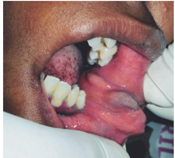
Fig. 3: Intraoral view