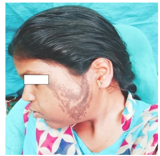
Fig. 1: Extraoral view

The patient was advised routine blood investigations which came out to be within normal limits. After which patient was advised Ultrasonography which was suggestive of lymphangioma, further patient was advised an incisional biopsy under local anesthesia for more improvised diagnosis and the histopathological diagnosis of cellular hemangioma was given.