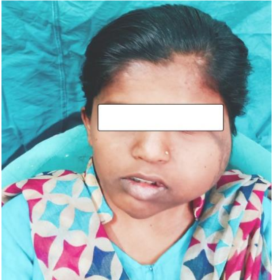
Fig. 2: Extra oral view