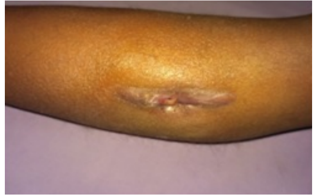
Fig. 1: Showing discharging sinus and scar over the lateral aspect of the leg.

COM is described as a long-standing infection of the bone, characterized by the growth of microorganisms, presence of a dead bone with surrounding unhealthy granulation tissue, inflammation and sinus discharge. Male patients were more affected than a female with a ratio of 2.7:1 and, most