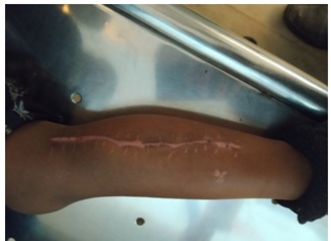
Fig. 6: Healing of sinus tract in situ.